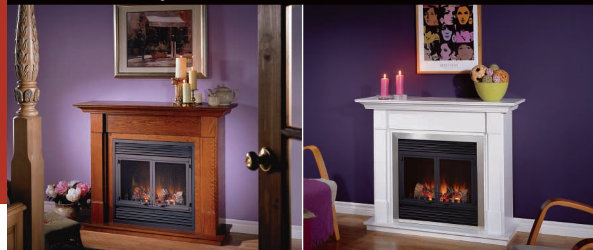
DEF26 with Smithville cabinet in dark oak finish