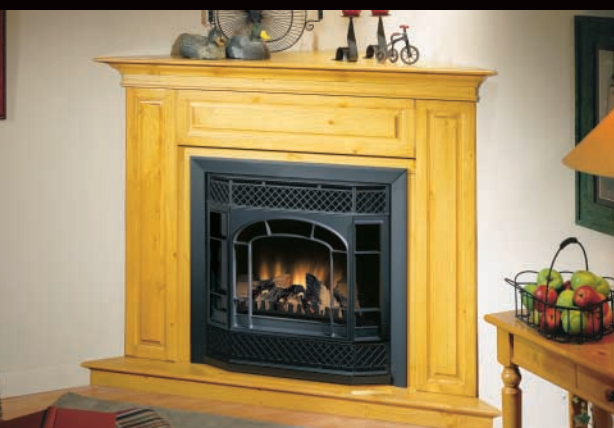
DEF36 with Cast Bay Window Trim Kit Medium Black Trim and Provence Corner Cabinet in Spice Pine