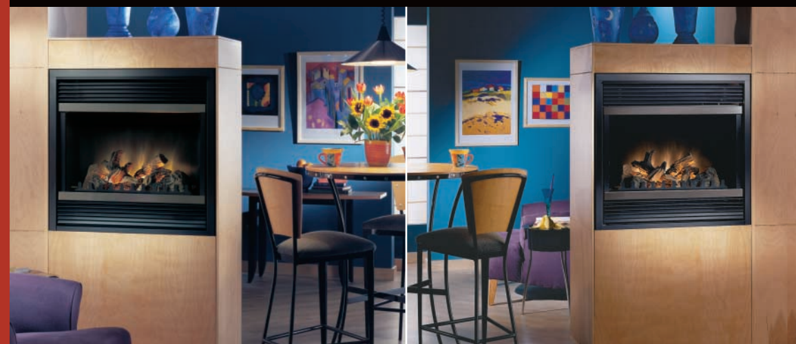
DEF36S2 - An industry first. Our two-sided electric model makes an impression to two rooms at once. Comes with both circulating and radiant louvers.