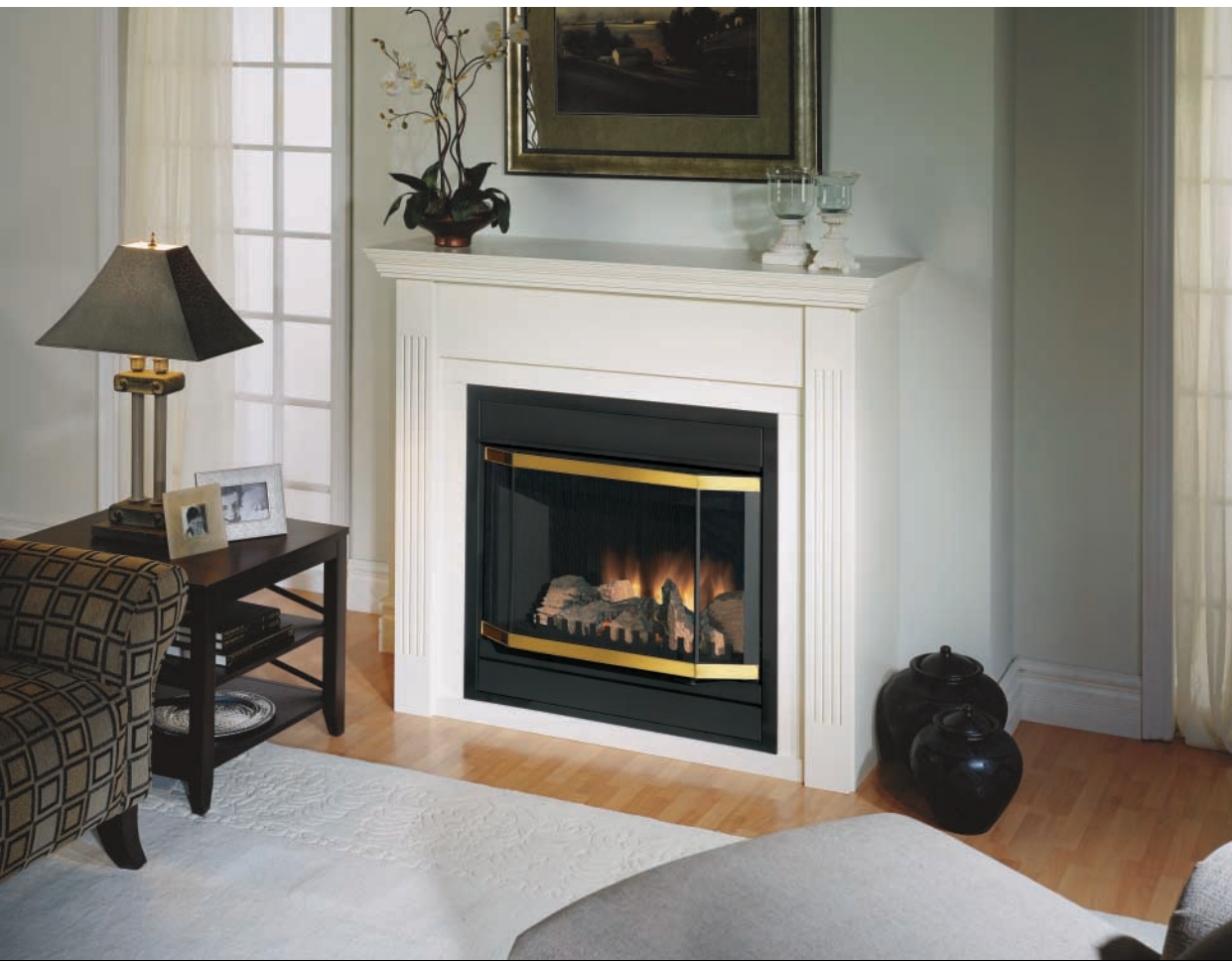
DEF36 with Bay Window Screen Kit with Polished Brass Window Trim and Northland Wall Cabinet in Warm White