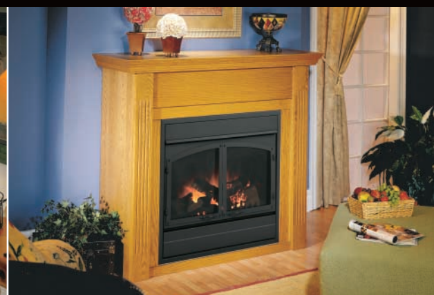
DEF36 with Black Arch Screen Door Kit and Northland Wall Cabinet in Medium Oak

Electric Fireplaces are the fastest growing category in Fireplaces and Vermont Castings™, Majestic™ is leading the way, with more models and more realistic flames - "the flame ya gotta see to believe." The models include: DEF26, DEF33, DEFD33, DEF36, DEFD36 and DEF36S2.