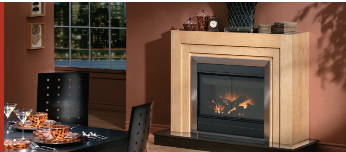
DEFD33 with Medium Pewter Trim and Manhattan Cabinet

*See the Cabinet Mantel brochure for full details